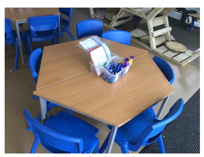
The tables in Class 2