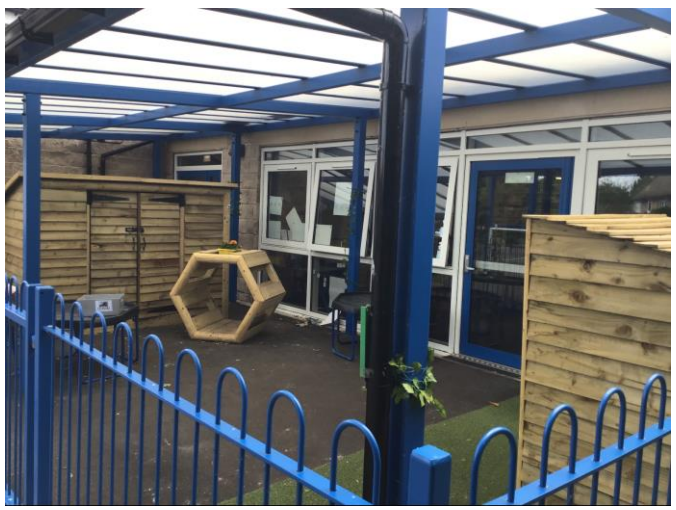
The outside play area in Class 2