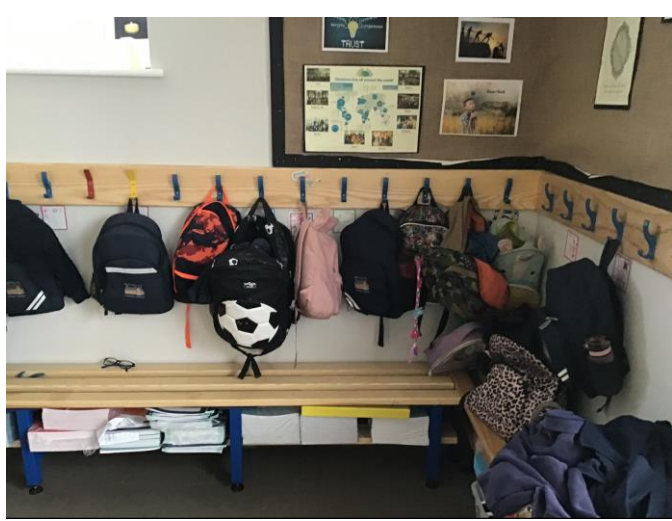
Where you will put your coat and bags